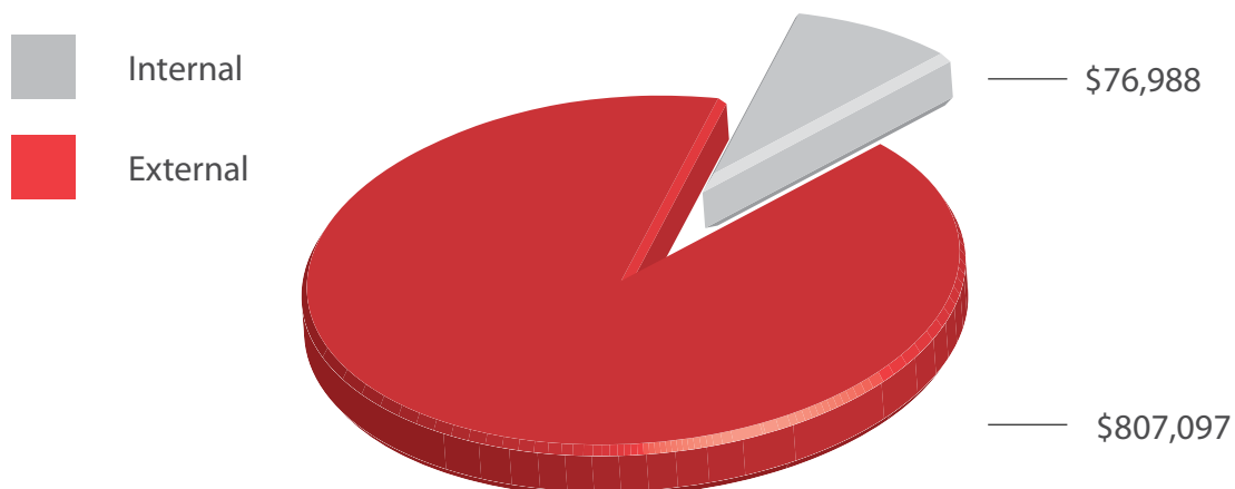
Figure 1 – Grant applications overview for 2011

A number of grant applications have been made by the NRU team in 2011. In the main, most applications were made to external funding bodies. Some results of applications are still pending at the time of this report. Figure 1 below provides an overview of applications made. Further details of each grant application and amount applied for can be located in Table 1.